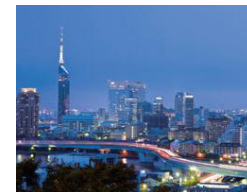
Fukuoka City (Fukuoka)

冬休みや春休みを利用して、九州や日本各地を旅することもできますし、船や飛行機を使えば韓国や中国もすぐそこです。このような旅を通し、アジアへの理解を深めることもできるでしょう。