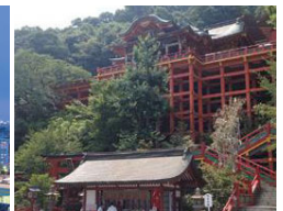
Yutokuinari Shrine (Saga)