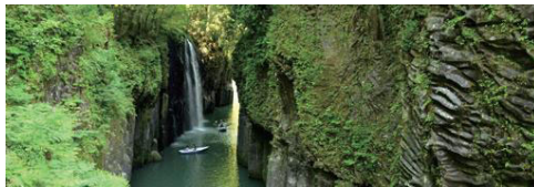
Takachiho Gorge (Miyazaki)

A land of mountains, hot springs, and historic treasures, Kyushu has always been at the center of Japan's cultural contacts with the world outside. You can take advantage of winter and spring breaks to explore the island or other parts of Japan, while Korea and China are just a short trip away by hydrofoil or plane. It's a great way to deepen your understanding of this fascinating part of Asia.