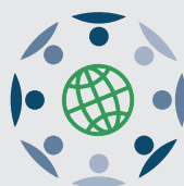
multicultural learning environment