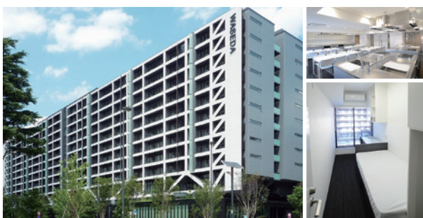
WISH, an internationalized student dormitory, develops attractive programs in an international environment resulting from the mix of students living here. The Live-in House Master and RAs (Resident Assistants), usually comprised of senior university students, also support the students in their new dorm life.