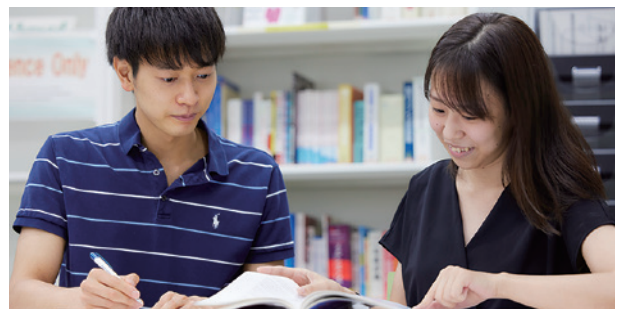
A number of scholarships are available for international students, including scholarships offered by Waseda University, scholarships from the Japan Student Services Organization (JASSO), and scholarships from private foundations.

Waseda offers over 250 scholarships for international students and Japanese students, including those sponsored by the University itself and ones sponsored by the private sector. While most scholarships are need-based and need to be applied after entering the university, some scholarships such as merit-based can be determined before program enrollment, based on the results of entrance examinations. In 2022, 12,500 students received scholarships, amounting to 7.7 billion yen. About 30% of international students studying at Waseda received some form of financial support in 2022.