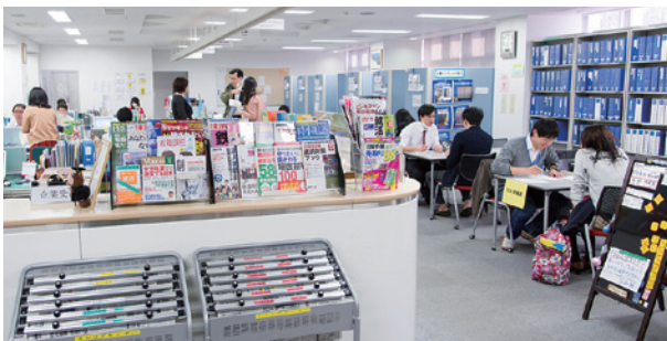
The Career Center is located on the Toyama Campus. You can find many useful materials in our office.

We also offer short-term study abroad programs featuring language training and cultural experiences, available during the spring & summer breaks. Step into a new world by taking advantage of numerous study abroad programs at Waseda!